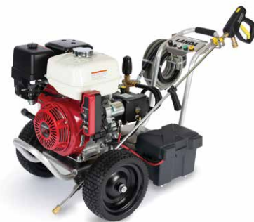
Electric start model with included battery